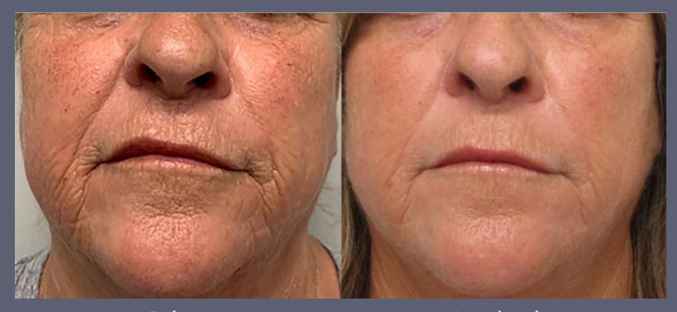
Morpheous8 ~ 3 Treatments Performed 1 Month Apart

Adjustable depth and energy settings customize and optimize treatments for each patient and for different treatment areas. The adjustable treatment needles penetrate into the subdermal tissue to shrink connective tissue and to stimulate collagen and elastin production. We may recommend MicroNeedle RF for patients having face and neck surgery to increase collagen prior to and after surgery.